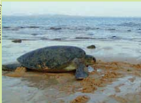
The Green Turtle