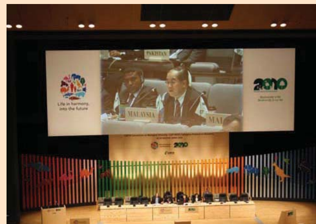
The Malaysian delegation to the COP10 in Nagoya, Japan. Dato Sri Douglas Uggah Embas (on screen) - NRE

For further information please contact: Sabah Parks - sabahparks@sabah.gov.my / sabahparks@gmail.com