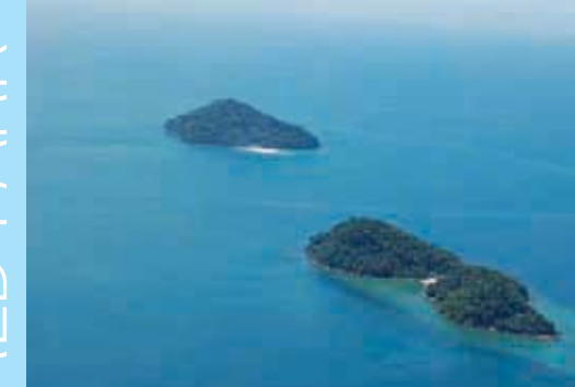
Talang Besar and Talang Kecil