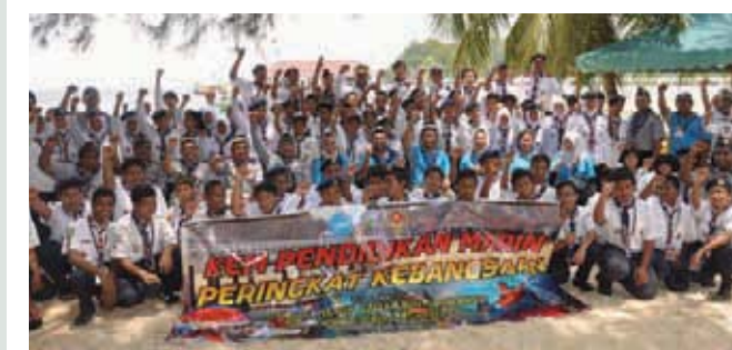
Peserta Kem Pendidikan Marin JTLM Bersama Persekutuan Pengakap Malaysia