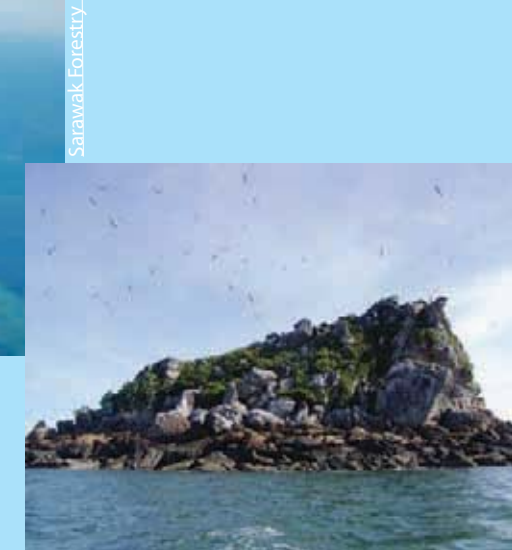
Pulau Tukong Ara