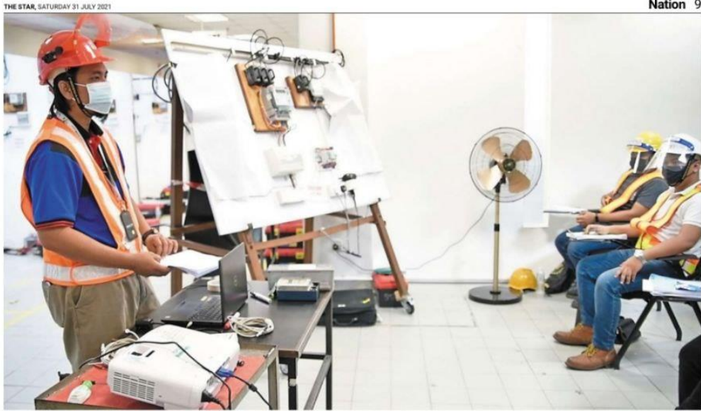
TNB Reskilling Malaysia supports companies by providing recruitment services and candidate sourcing for their business development.