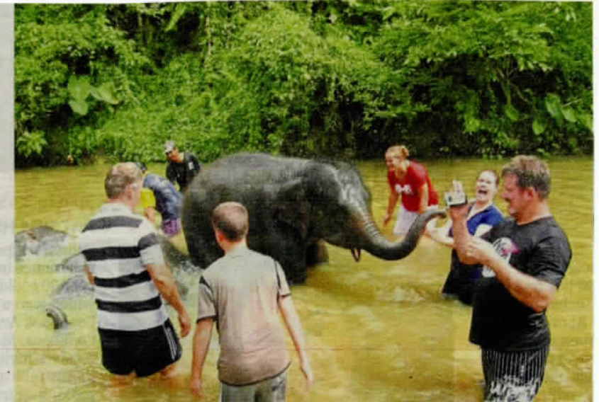
Visitors enjoying their time in the river with a baby elephant during a bathing session.

Elephant visits take place in the afternoon and visitors will be able to get up close with the animals under close supervision of the