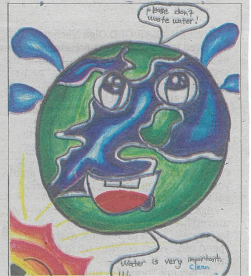
Tan Li Ren, 9.

asked our young readers to submit their letters and drawings on water. Judging from the responses, we can safely say there are many young water conservationists out there!