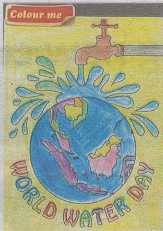
Tamaraa/p Parameswaran, 8.