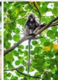
The Shah Alam Community Forest is home to different types of animals, including this dusky leaf monkey.

dipterocarp forest in the Petaling district.