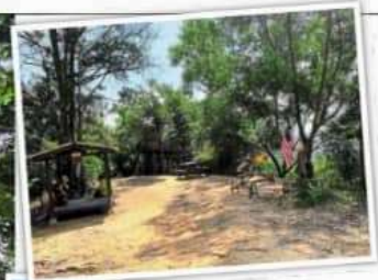
The peak garden allows hikers to relax and take a break before continuing on their journey.