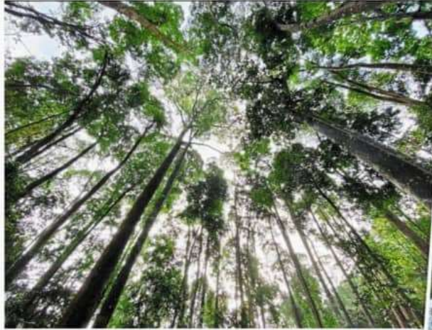
A thick green canopy provides shade to hikers as they walk through the forest in Shah Alam.