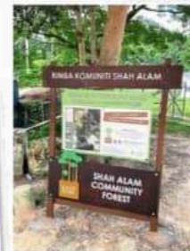
The signboard by SACEF Society at the entrance of the forest in Section U13, Setia Alam.

"Together, we are able to contribute to the preservation of the last remnant of lowland mixed