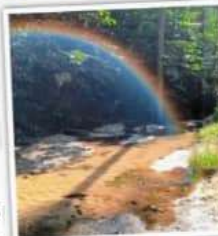
A rainbow above the water as sighted by one of the hikers.

"The SACEF society set up trails on private land. "Prior to this, the society has urged the government to gazette the land as a permanent forest