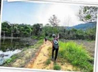
Hikers of all ages enjoying a hike at the forest in Bukit Cheraiah, Shah Alam.